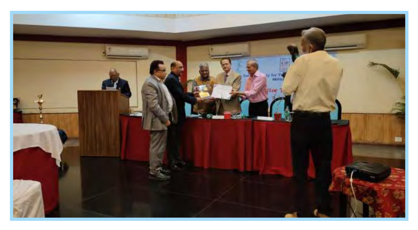
MD , MPCON Receiving ISTD Award for Trainers