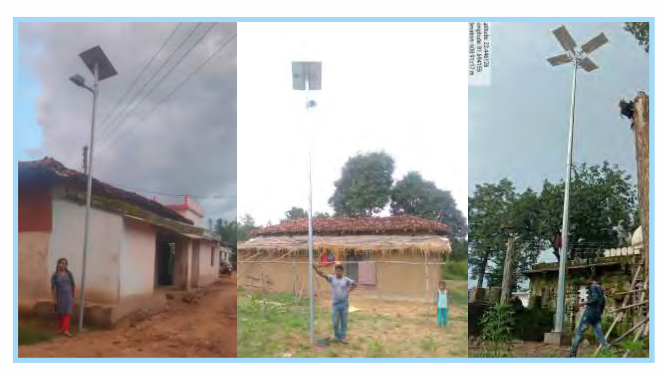
Solar Light Installation by MPCON under MPLDS/MLALADS Fund